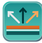
MULTIPLE SURFACE SOLUTIONS